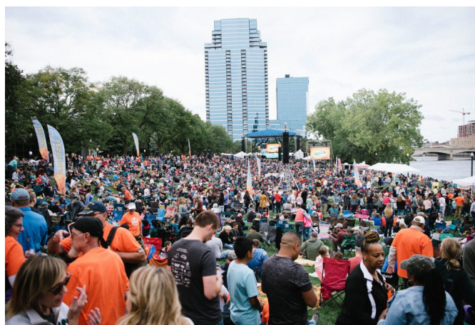
Thousands turned out for the two-day festival, a culmination... and a beginning for West Michigan.

Large crowds experienced extreme sports, children's activities and concerts, all designed to set the stage for this famous pair of evangelists to deliver a message that brought more than 1,800 people to a point of decision, some for salvation, some for rededication. Members of CrossWay were there, volunteering as Festival Friends.