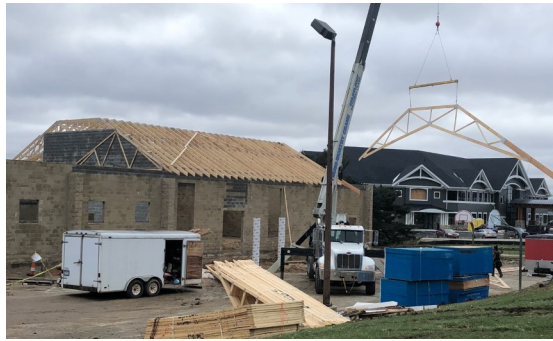
Outside . . . Raising the Roof!