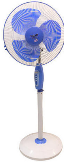
Relegated to relic status!

Still underfunded are other aspects of our remodeling/expansion endeavor, so