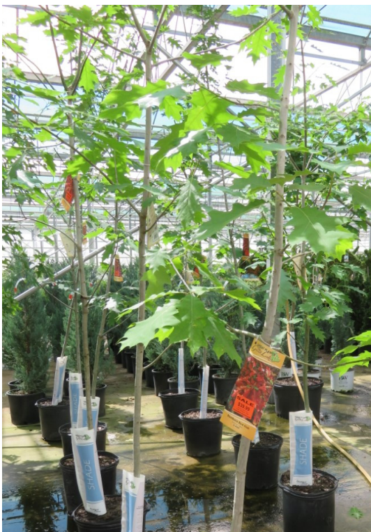
Coming soon to the hill s.w. of the parking lot . . . red oaks