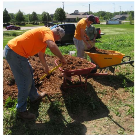
CrossWay's landscaping crew . . . just us!