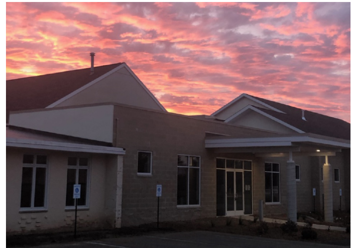
Dawn has broken over CrossWay Community Church and our new western entrance.

Coffee service is now offered in our new lobby at 9:30 a.m. on Sundays, before 10 a.m. worship. And our new restrooms are available just off the lobby. Just a few steps further south brings the member or visitor to our gleaming new, modern kitchen, our new classroom/conference room and the big-as-a-barn multipurpose room.