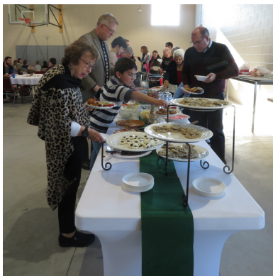
Sharing a meal with friends